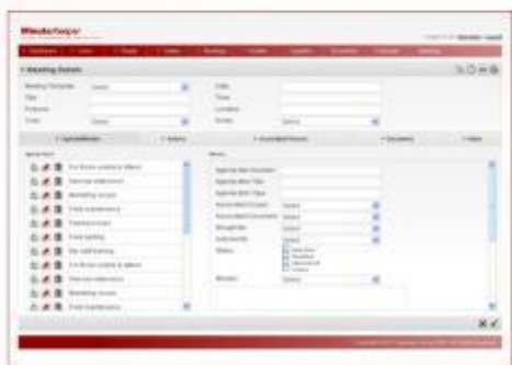
A sample screenshot of Minute Keeper®

Software for Managing Meeting Agendas, Minutes & Actions